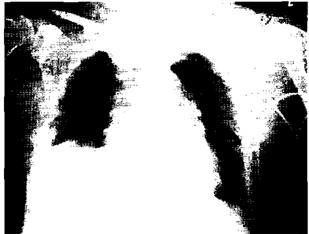
Fig. 1. Chest radiograph with portable machine. There is exaggerated lung marking with no obvious infiltration.

On examination, the patient was pale, edematous, lethargic and appeared chronically ill. He was in a deeply stuporous state and was barely arousable. The temperature was 34.7 °C, the pulse was 70/min, and blood pressure was 153/91 mmHg. He had a slightly protruding tongue. There was a tracheostomy in situ and the patient was on assisted breathing. The heart sounds were distant, and sonorous rhonchi and fine crackles were heard on both lung fields. The abdomen was soft and slightly distended, the bowel sounds were normoactive. There was general nonpitting edema and the skin appeared coarse and dry. There was diffuse muscle weakness and wasting, and general areflexia. A chest radiograph with portable machine showed exaggerated lung marking with no obvious infiltration (Fig. 1). An echocardiogram revealed a mildly dilated left ventricle (LV), concentric LV hypertro-