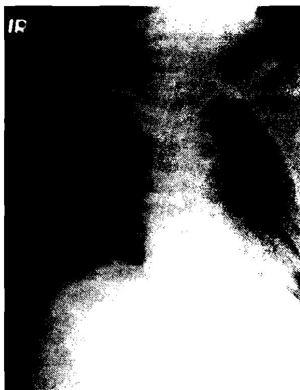
Fig.3. Follow-up chest film near the end of weaning. There is mild perihilar pulmonary congestion indicating fluid overloading; and abdominal gaseous distention.

The patient died of an unexpected heart attack two weeks after weaning. No autopsy was performed.