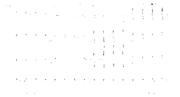
Fig. 2. Electrocardiogram showing nonspecific T wave changes and prolonged QT interval.

phy, adequate LV performance, and possibly impaired LV relaxation. The electrocardiogram showed nonspecific T wave changes and prolonged QT interval (Fig. 2). A thyroid sonogram revealed atrophic change in both lobes with no notable parathyroid gland.